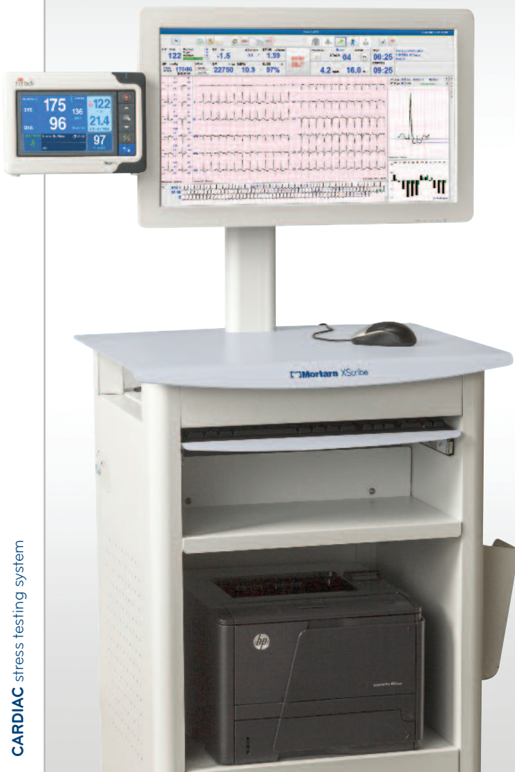
CARDIAC stress testing system